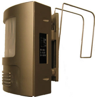
Insert Hanging Bracket from bottom as shown.

An "Over the Door" Hanging Bracket is included that allows you to easily hang your "Door Beacon" on any standard door. It also allows the convenience of moving the "Door Beacon" to a different door.